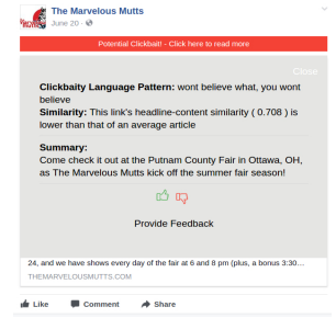
Figure 3: Explanation of the decision and content Summary

each anchor and inserts the object above the corresponding anchor element. Figure 2 and 3 show the graphical user interface (GUI) of the extension. The example post in the figure contains a clickbait headline. For the posts which are not classified as clickbait, BaitBuster just shows options for providing feedback, so that users can inform about false negatives. The BaitBuster Facebook page is administered by a bot using Facebook API (details in section 6.2.2).