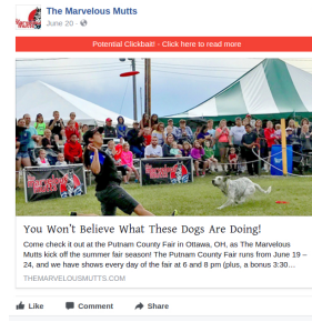
Figure 2: BaitBuster identifies clickbait post in Facebook

6.2.1 Client. This component has a JavaScript based browser extension and a bot powered BaitBuster Facebook page. The extension scans the Document Object Model (DOM) of the current page, identifies the anchor elements ( <a href=...> ), and sends the anchor texts and the corresponding URLs to the server side using POST request. The server processes the request (details in section 6.2.2) and sends response back to the client. Then the extension creates a new DOM object with the clickbait decision for